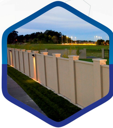
PROJECT BOUNDARY (COMPOUND WALL)