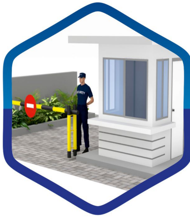
24/7 SECURITY WITH SECURITY CABIN