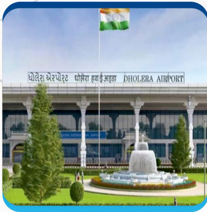
DHOLERA INTERNATIONAL AIRPORT