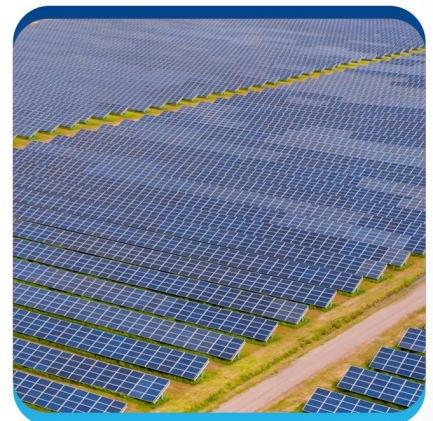
WORLD'S LARGEST SOLAR PARK (5000 MW)