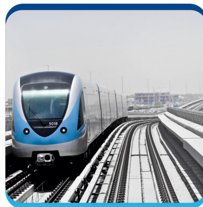
MONO RAIL CONNECTIVITY AHMEDABAD-DHOLERA