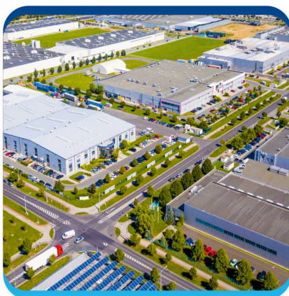
GREEN FIELD INDUSTRIAL PARK