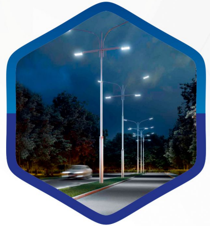
INTERNAL ROAD/ STREET LIGHTS