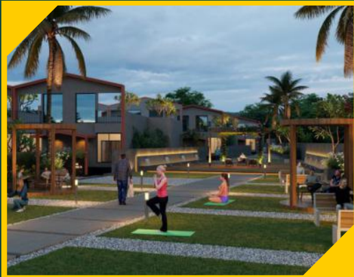
Senior Citizen Park